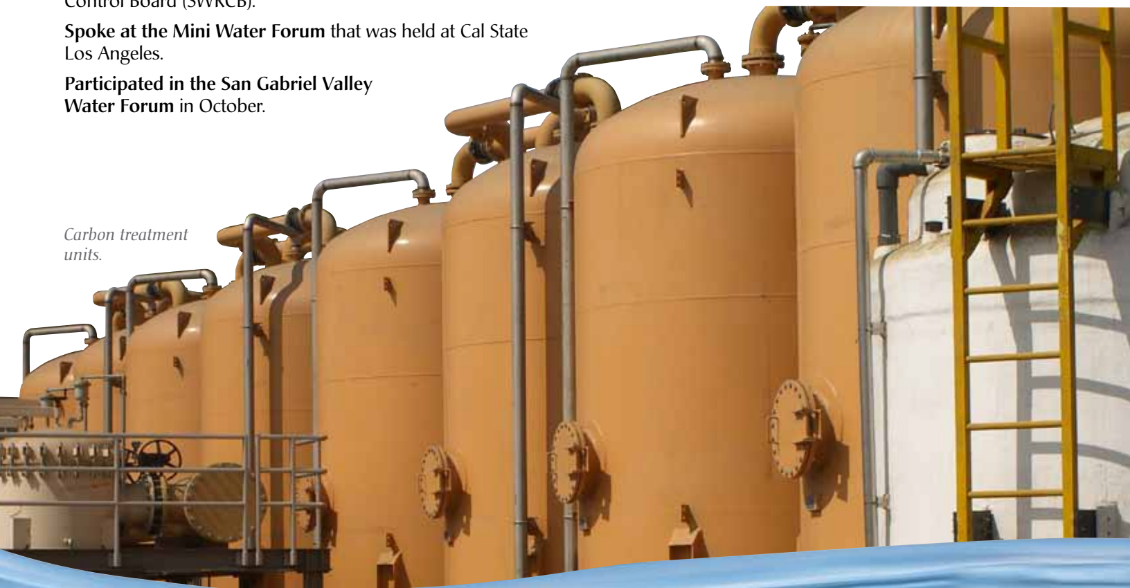
Carbon treatment units.

The Staff and the Board reviewed WQA's investment portfolio and banking relationships. The goal was to ensure safety and liquidity over yield in its investments, and cost-effective service from its bank.