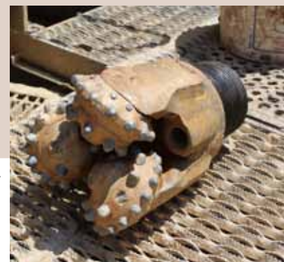
Drill bit used on water wells.