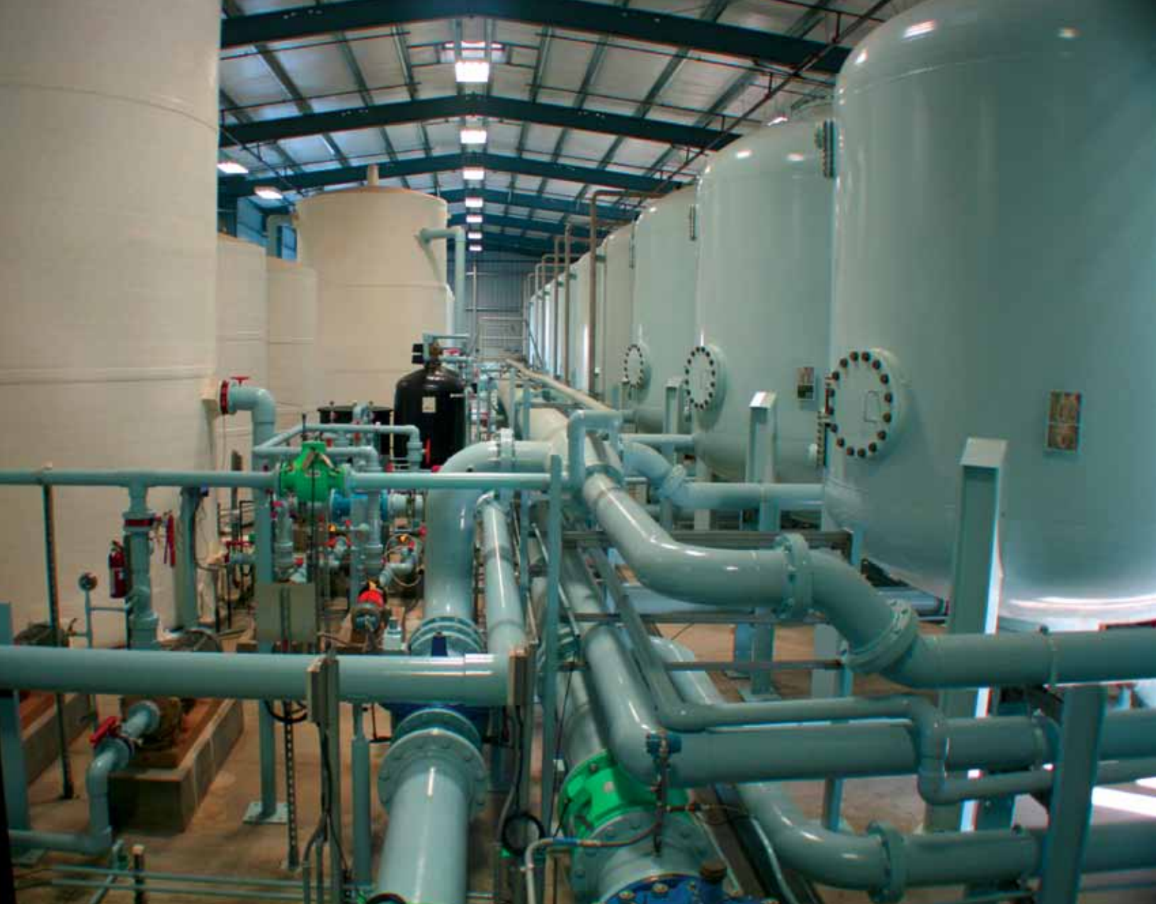
Pictured above: City of Alhambra Treatment Plant.

La Puente Valley County Water District: Wells 2 & 3 (BPOU)