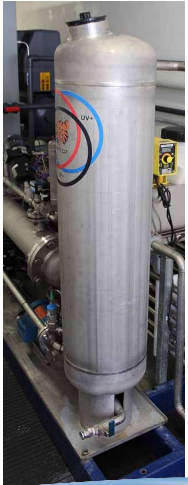
Pilot treatment in El Monte.