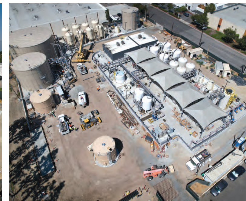
The Puente Valley Operable Unit Intermediate Zone Remedy is the first groundwater treatment facility in the basin to incorporate state-of-the-art Reverse Osmosis in its treatment process.

To date, 32 treatment plants have removed 195,000 pounds of contaminants and treated 1.8 million acre-feet of groundwater.